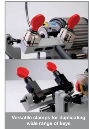
Versatile clamps for duplicating wide range of keys

* AlTiN coated cutting tools typically last between 3 and 10 times longer than uncoated tools.