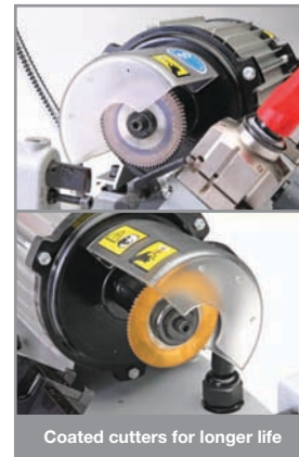
Coated cutters for longer life