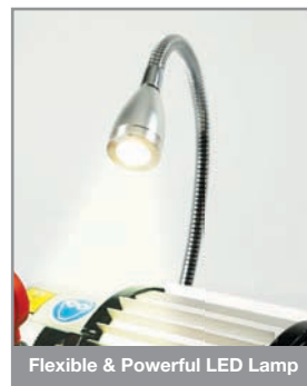
Flexible & Powerful LED Lamp

Duo Lite is lightweight, compact and easy to be carried.